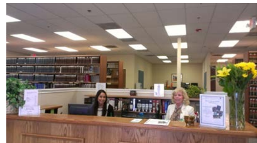
The law library moved from the Justice Larson Center to its temporary site in Indio while the new County Law Building is being built.

The Main Library contains the largest print collection which includes California, Federal, and national-scope law resources, as well as superseded and historical materials. It maintains a collection of all 50 state codes. It also houses local materials, including City and County codes and ordinances. The library's collection of practice materials is limited to California, Nevada and Arizona.