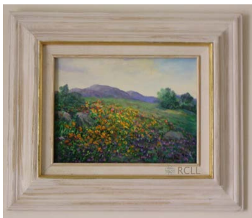
California Poppies